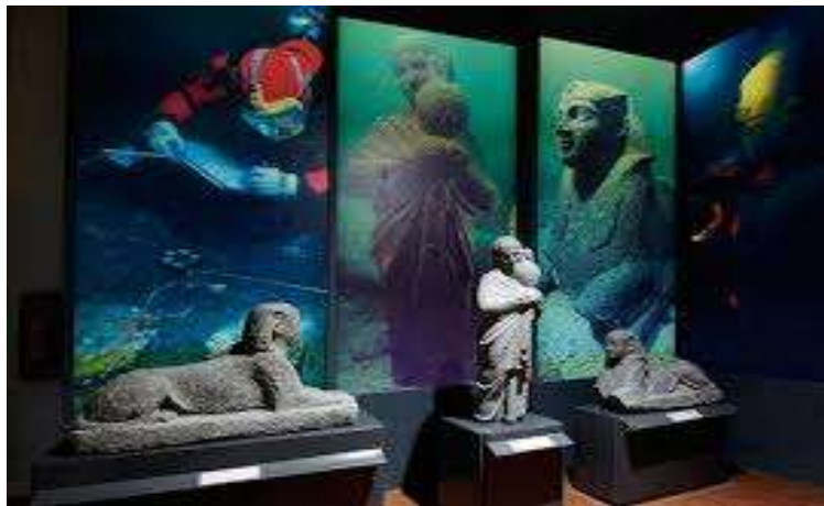
Alexandria National Museum